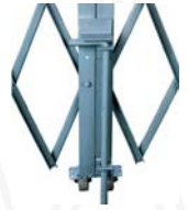
Double Gate Drop Pin