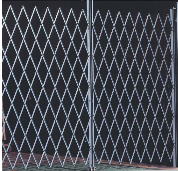
Save-T Guard Folding Security Gates are the most economical solutions for increasing safety, security and productivity.

Many sizes available to ship within 1-2 days, and most gates are light enough to ship via UPS.